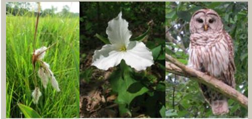
Common cottongrass, trillium and barred owls are among many species that call Moraine home.